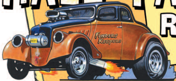
FINDERS KEEPERS GASSER