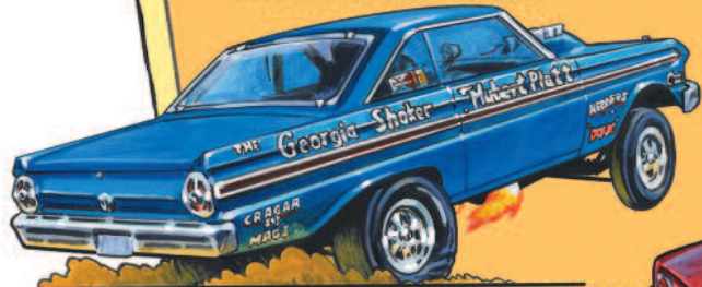
THE GEORGIA SHAKER